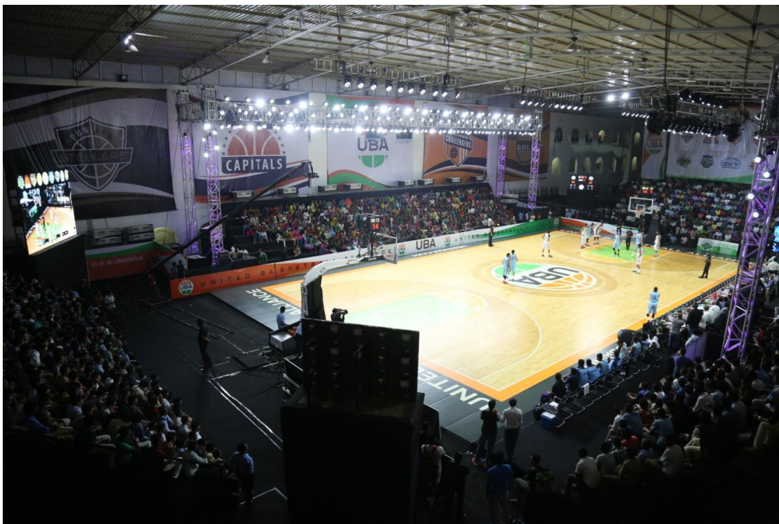
Indoor Basket Ball Court

Sathyabama encourage students to participate in sports events. Sathyabama gives equal importance to sports and curriculum for all round development of students and greatly supports in shaping the career of students who are interested in sports. Sports facilities available in the campus include play courts, playgrounds for Volleyball, Basketball, Kabadi, Ball badminton, Tennis, Hand ball, Foot ball, Hockey, Kho-kho, Cricket and other outdoor games. Facilities for indoor games like chess, carom and table tennis are also available.