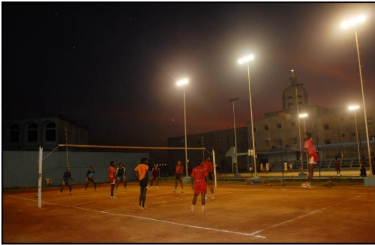
Volley ball court