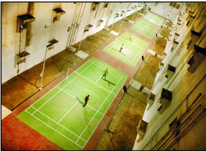
Outdoor Badminton court