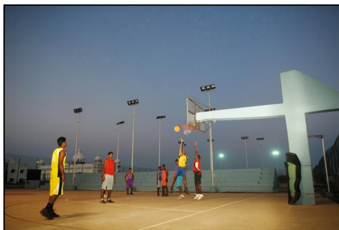
Outdoor Basket Ball Court